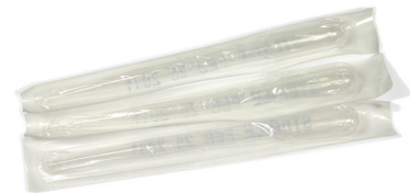
650.050.523 Individually Wrapped Sterile