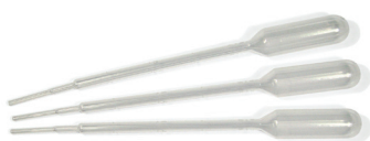
650.050.501 Bulk Non-sterile