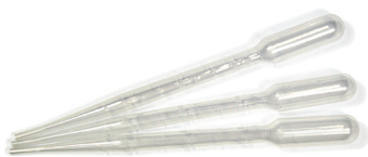
650.050.503 Bulk Non-sterile