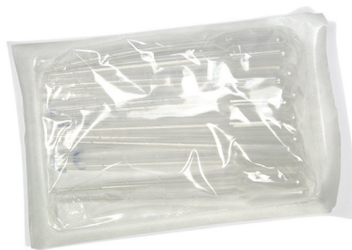
650.050.511 Inner Packs of 20 Sterile