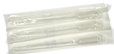
650.050.521 Individually Wrapped Sterile