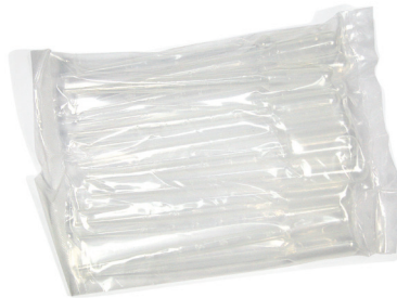
650.050.513 Inner Packs of 20 Sterile